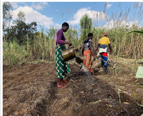
Photo: Communal gardening championed by this project in Chitete town-Malawi

This research quest seeks to establish an institutional framework and extension model for continued community support that engages and empowers villagers to design, implement, and manage local infrastructure and development projects. (This is being done in partnership with Malawi government, Malawi universities, and Non-Governmental Organizations (NGOs). Community development in Malawi rarely starts from grassroots and its predominantly top down.